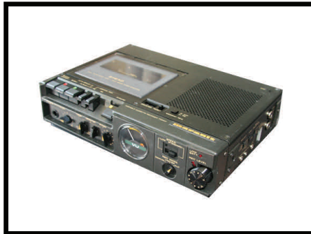
Audio Cassette Recorder