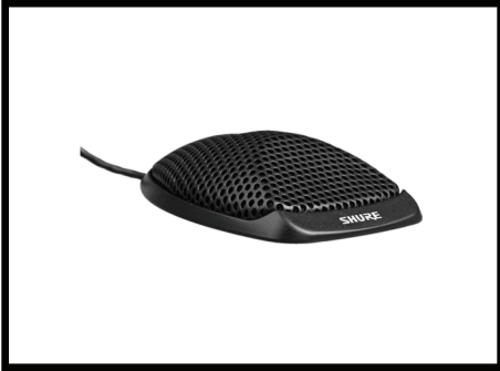
Omnidirectional Condenser Microphone