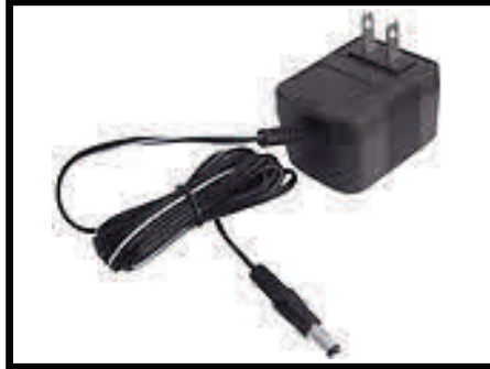
Marantz AC Adapter