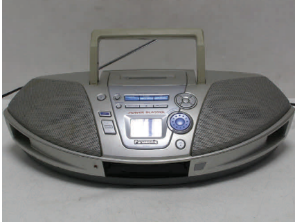
Panasonic CD/Audio Cassette Player