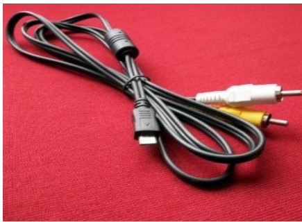
AV Composite Cable