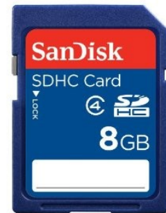
8 GB SD Card