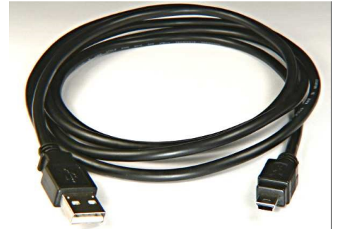
USB Power Cable