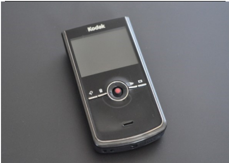
Kodak Zi8 Camera