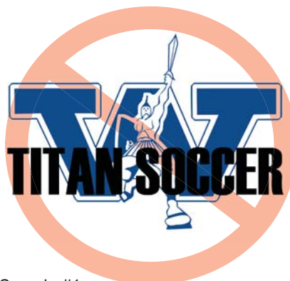
Sample #1 - No graphic elements in protected area